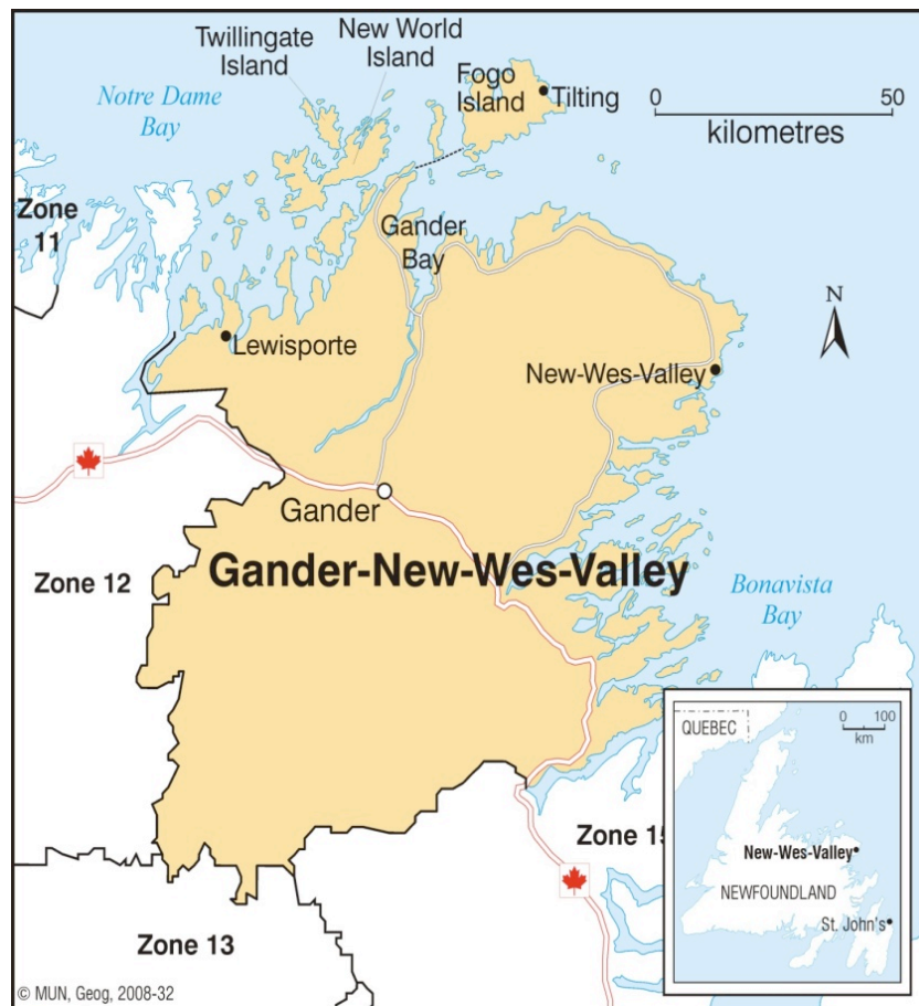
Figure 1: Map of Kittiwake Region

The Kittiwake region is located on the north eastern coast of the Island portion of Newfoundland and Labrador. The region consists of approximately 120 communities, spanning west to Lewisporte, east to Charlottetown, and north to Fogo Island (see Figure 1). Most of these communities are located in coastal areas and are considered to be rural in nature. Only six communities within the region have a population of over 2,000, with Gander being the largest community and the primary service centre for the Kittiwake region (KEDC, 2007, p.2). The region also encompasses three inhabited islands that are accessible only by ferry: Fogo Island, Change Islands, and St. Brendan's (KEDC, 2007, p.2).